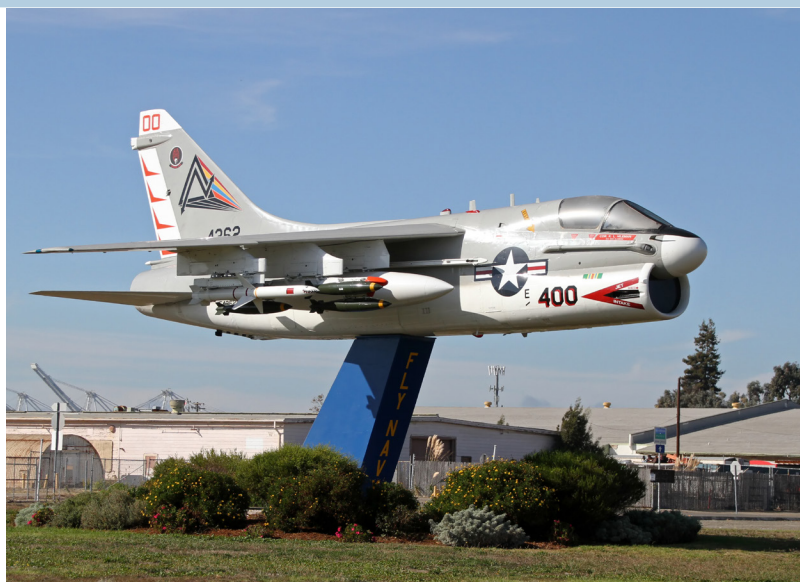
Photograph of mounted A-7 Corsair airplane at Naval Air Station Alameda. Photo by: Tony Hisgett dated 9 October 2014 License: CC BY 2.0; https://commons.wikimedia.org/w/index.php?curid=64150415

Low-level radiation, below ground at Landfills 1 and 2, is below harmful levels. Recreational users are not expected to be harmed by touching the ground, walking, or running on the paved trails along the landfills. The Navy has cleaned up and removed radioactive material in the soil and installed barriers to prevent contact with material below the surface that may remain at the landfills.